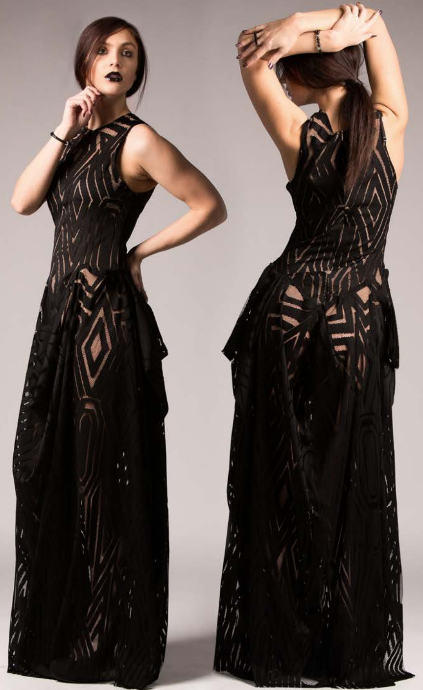
LACE "NAKED" GOWN WITH CHIFFON LINING