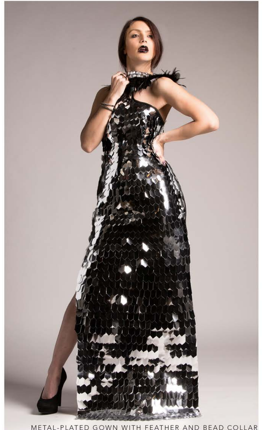
METAL-PLATED GOWN WITH FEATHER AND BEAD COLLAR