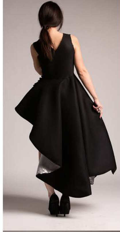
ASSYMETRICAL DRESS WITH METAL-PLATED DETAILING