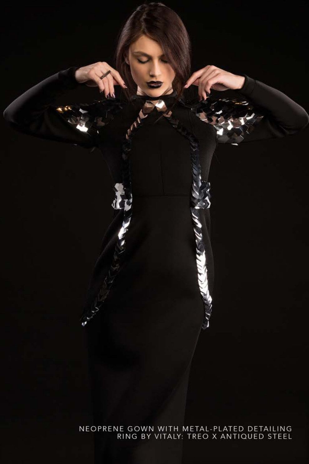
NEOPRENE GOWN WITH METAL-PLATED DETAILING RING BY VITALY: TREO X ANTIQUED STEEL