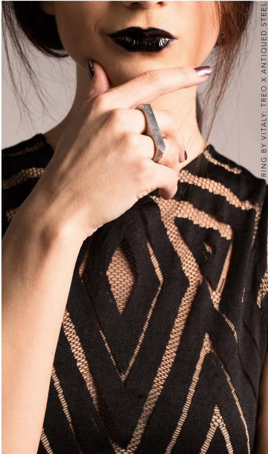
RING BY VITALY: TREO X ANTIQUED STEEL