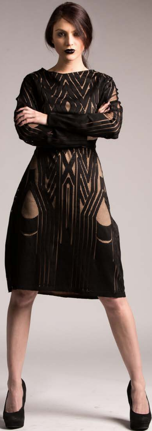
BELTED LACE SHIFT DRESS WITH JERSEY LINING